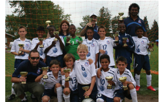
Brampton Blast U9A 2009 SRSL Mini League Champions